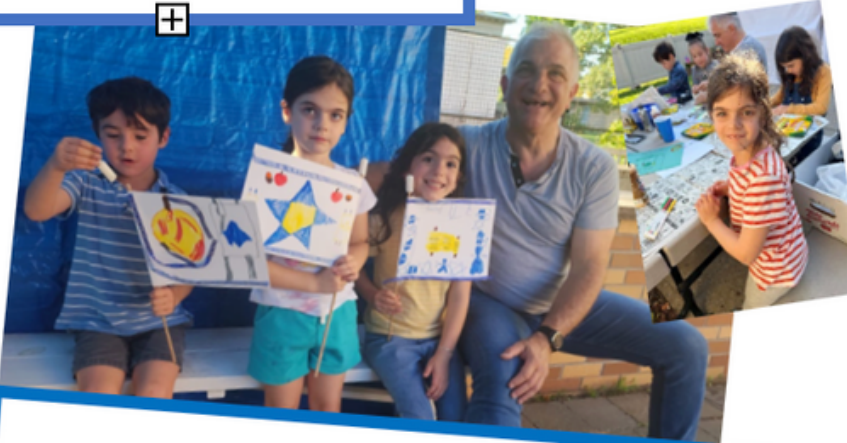
Everyone is so delighted with their decorations.