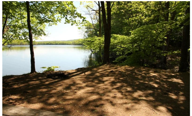
Delta Lake State Park Campground, Rome, NY